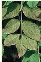
Typical ozone-induced foliar symptoms on plants native to